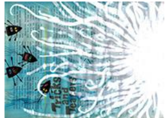
Figure 5 http://everypageofmobydick.blogspot.com

Another work of Kish's that is based on Chapter 59, takes inspiration from the same passage that Stella's print The Squid is centered on. This piece is titled " The four boats were soon on the water; Ahab's in advance, and all swiftly pulling towards their prey. Soon it went down, and while, with oars suspended, we were awaiting its reappearance, lo! in the same spot where it sank, once more it slowly rose. Almost forgetting for the moment all thoughts of Moby Dick, we now gazed at the most wondrous phenomenon which the secret seas have hitherto revealed to mankind. A vast pulpy mass, furlongs in length and breadth, of a glancing cream-color, lay floating on the water, innumerable long arms radiating from its centre, and curling and twisting like a nest of anacondas, as if blindly to clutch at any hapless object within reach. No perceptible face or front did it have; no conceivable token of either sensation or instinct; but undulated there on the billows, an unearthly, formless, chance-like apparition of life " (Figure 5). In