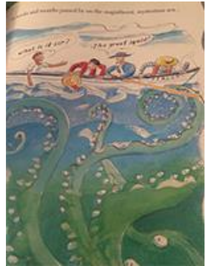
Figure 7 http://allandrummond.com

In Drummond's illustration of the scene concerning the squid, the animal's appearance is bright green with whimsical tentacles suctioning onto the Pequod's port and starboard sides. Drummond's rendition provides an easily identifiable, cartoon-like depiction of the creature (Figure 7). Unlike the tension in Stella's squid, Drummond's gentle washes of primary color appeal to the youthful eye, and the lack of structured, bold line work suggests a tone of ease and tranquility. In opposition to the original intentions of Melville's description of the squid as cream-colored and an