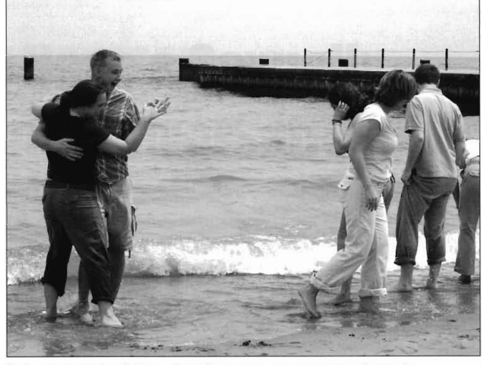
Students from the Loyola University of Chicago enjoy time together at the beach.

On the topic of setting boundaries and abstinence: many students see the idea that they can set boundaries with regard to sex and their