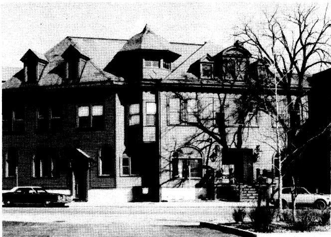
Century Hall, the East Side Performers' Workshop