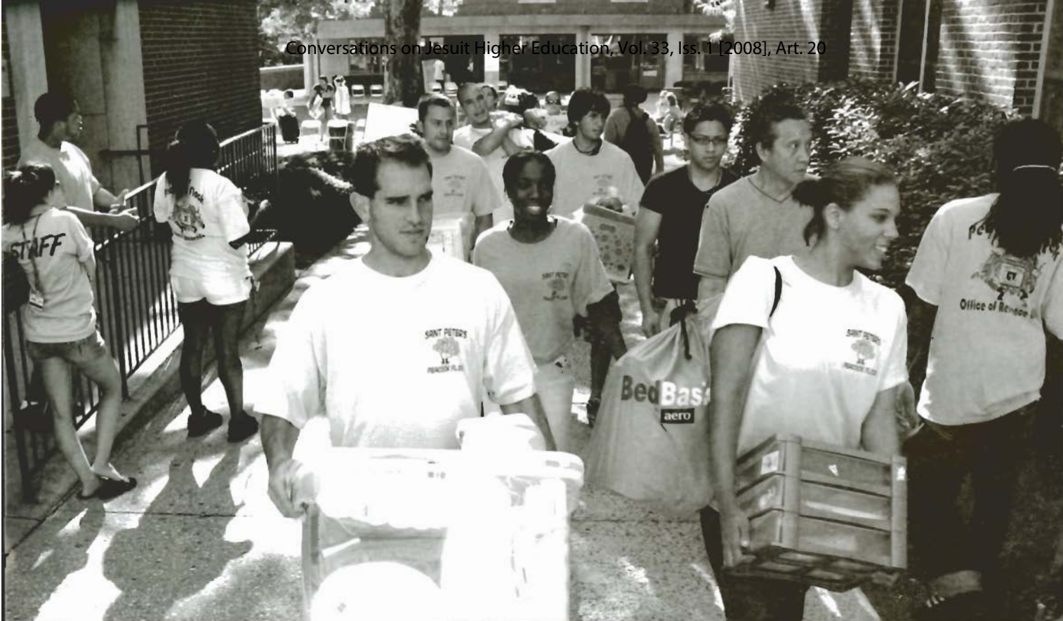
Fellowship and community lie at the heart of Saint Peter's College. The 'Peacock Flock' help freshmen move into their residence halls in the fall of 2007.

with their chemistry." The football player had to explain that he was tutoring the other students. We're all susceptible to these kinds of body-type prejudices.