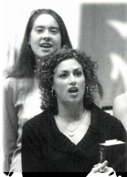
Baccalaureate Mass, 2002