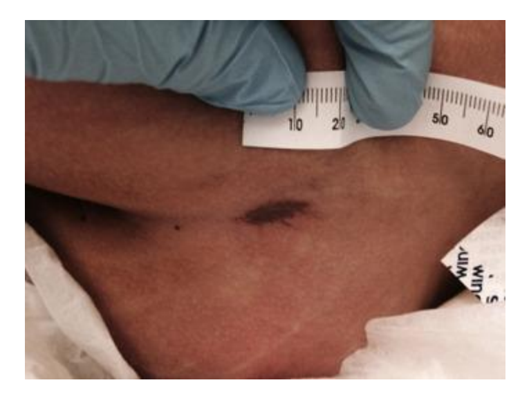
Figure 2. Pediatric Kennedy terminal ulcer.

This figure appears in color online at www.jpedhc.org.