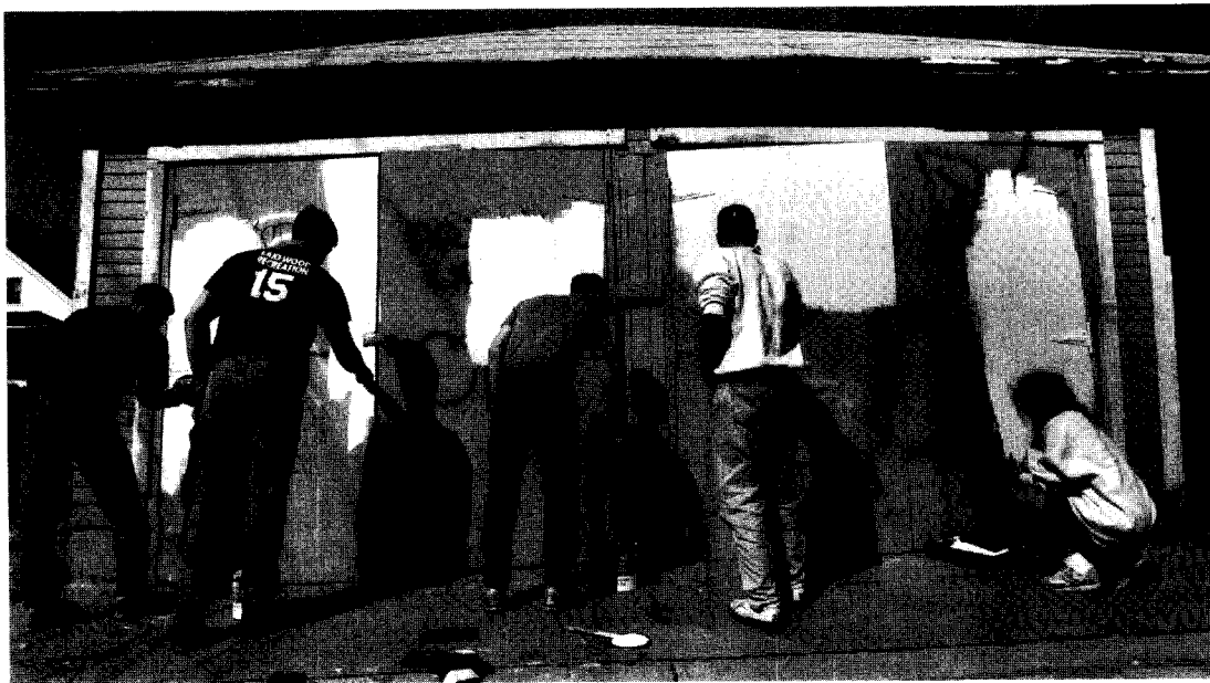
Each year some 1,200 Marquette students, faculty, and staff pitch in to raise money for local non-profits during Hunger Cleanup Day.

Religious Studies," also calls for each course to deal with the Jesuit tradition.