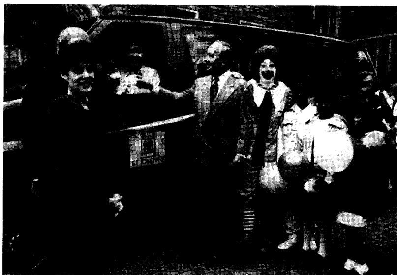
A Service Learning student accepts the keys to a van, donated from the Ronald McDonald Children's Charities in Philadelphia. The van is used to transport students from the campus to various service sites throughout the city.

The faculty-mentored student research program at Saint Joseph's has been a success for many years, particularly in the sciences.