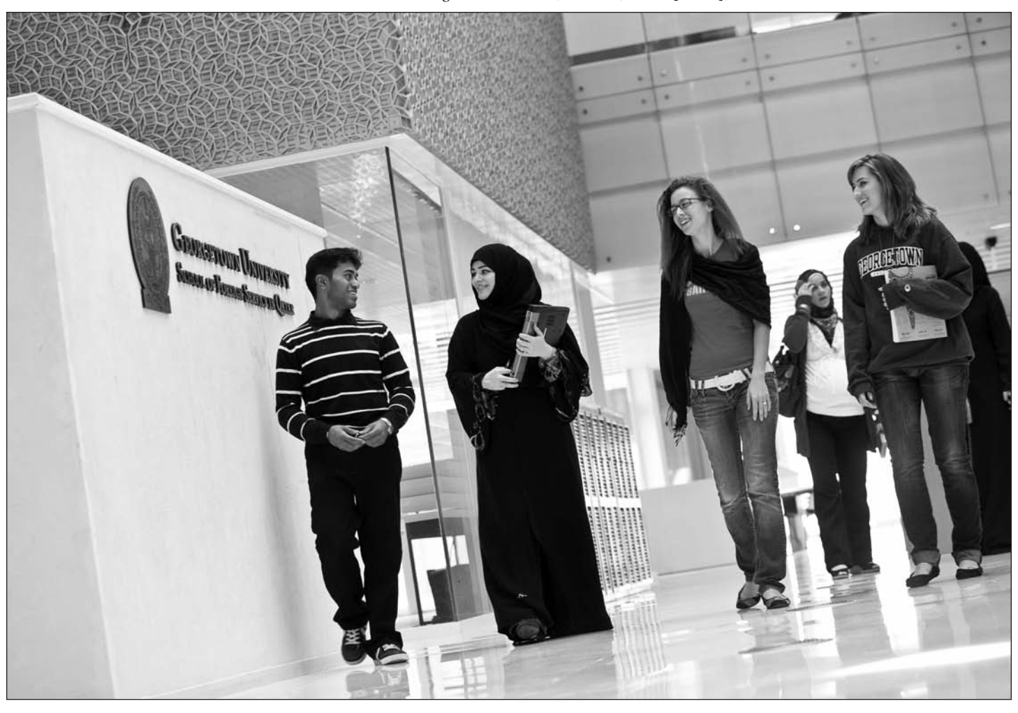
Georgetown University students at the School of Foreign Service, Qatar campus.

deliberations of the conference were galvanized and the delegates unified by synthesizing the state of Jesuit higher education through presentations from six major regions of the world. The questions for the conference were posed by learning of the challenges of globalization, post-Christian culture, formation for Jesuit educational identity, lack of financial resources, educating with a preferential option for the poor, respecting cultural identities, overcoming national allegiances and competition, post-modernism, the pressures to educate graduates for the new economy with adequate humanistic groundings, secularization, the new technological student, immigration, and the problem of graduating "professionals but not believers."