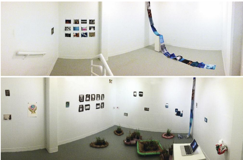
Two separate installations in the Experiment Space gallery, studio art program, Loyola Hall, Fairfield University. Top view: student work in a water focused course exhibition, Exposing Water, Digital Photography. Bottom view: Fair Weather: The Wetland Project with artist Mary Mattingly.

There is no denying water's impact on all of us on a global scale and yet it is so easily taken for granted. The impact of focusing on a universitywide theme encouraged students, faculty, staff, and the broader Fairfield community to reflect on their personal experiences, studies, and appreciation for this incredible resource. We hope Fairfield University's theme creates a "ripple" effect that pushes out and encourages a yearning to learn more and make a difference – whether through a student's research, a faculty member's commitment to helping students understand their impact on a vital source of life and commerce, or through a community member dedicating time to help keep our water clean.