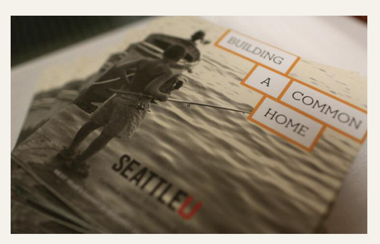
Seattle U Winter Catholic Heritage Lecture

Graduate theology students seem to be taking to this subject like fish to water; ecological themes are working their way into a diverse array of papers and dissertations. Undergraduate business majors have a hard time with the economic sections of "Laudato Si'," finding it hard to imagine how a successful business or the global economy can be run without profit as the main goal. Many other undergraduates resonate with the encyclical's spirituality. They simply take for granted that everything is connected, and enjoy the beauty of the vision as a whole.