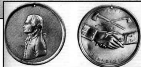
Thomas Jefferson Peace Medal in the Museum of Western Expansion, Jefferson National Expansion Memorial, St. Louis, Missouri.

Soon after achieving its independence, the United States recognized that North American Indian leaders coveted peace medals and adopted the distribution of these tokens as part of its diplomatic protocols. From George Washington (1789-1797) to Benjamin Harrison (1889-1893), the U.S. Mint struck a new se-