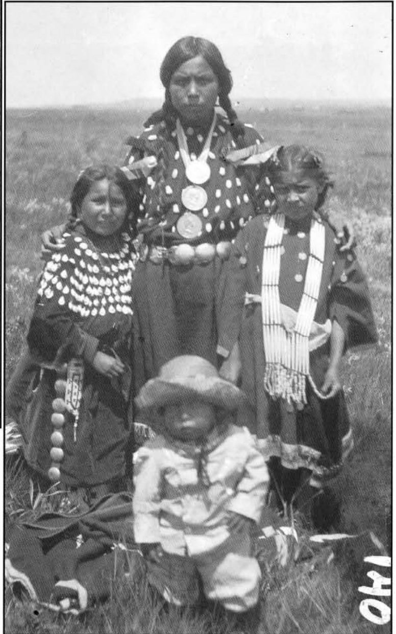
Figure C: Among these Sicangu children on the Rosebud Reservation in South Dakota, the eldest girl is believed to be wearing heirloom medals acquired from her relatives. She appears to be wearing Lincoln medals. ca. 1915-1925.

By the 20 th century, political realities had changed. Subordinate federal officials now represented the Presi-