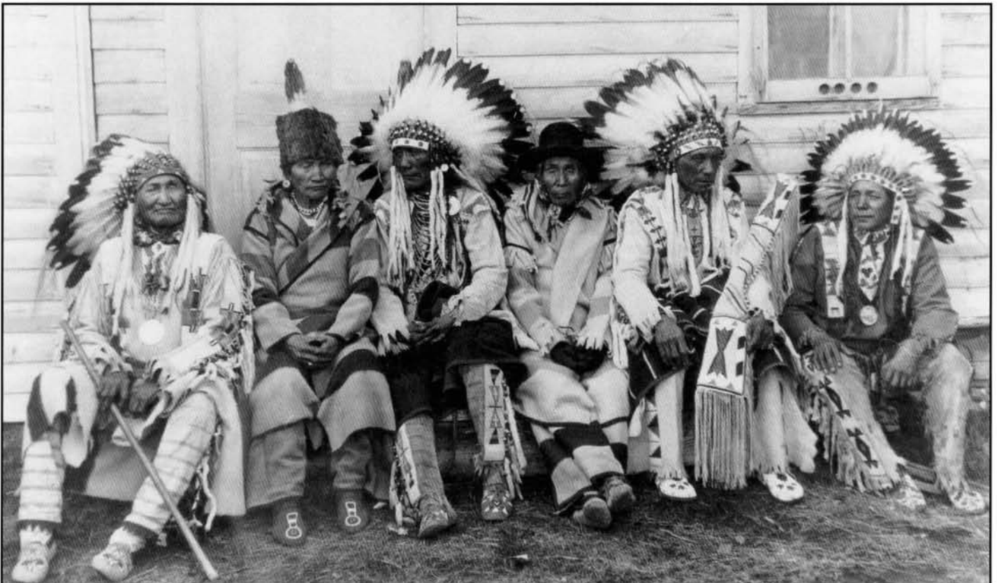
Figure E(below): Among these elders gathered on the Blackfeet Reservation in Montana, ca. 1930, note the peace medal worn by the man to the left.