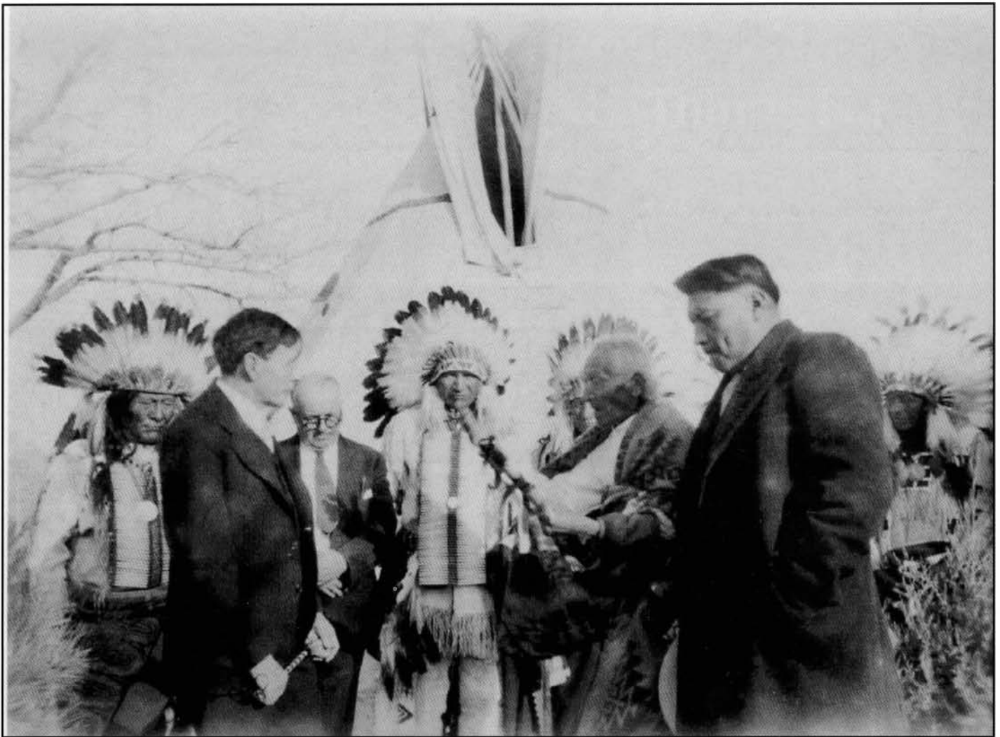
Figure F: Oglala elders presenting a pipe with an ornate stem to John Collier while he visited the Pine Ridge Reservation in South Dakota. Collier met with tribal leaders as representative of the Great Father and Commissioner of Indian Affairs. Note that at least one elder in the delegation is shown wearing a peace medal.