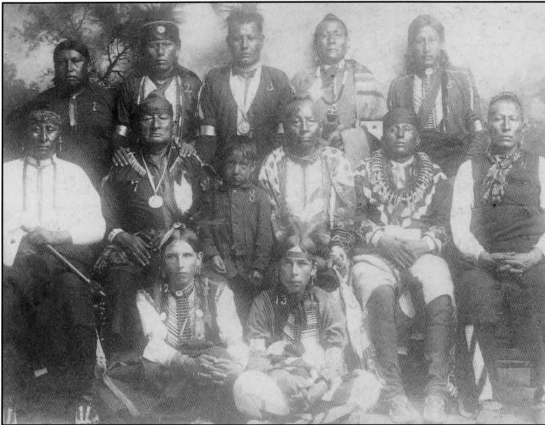
Figure D (left): The Osage Delegation photographed by the Studio of Prettyman and Cornish, Arkansas City, Kansas, ca. 1891.