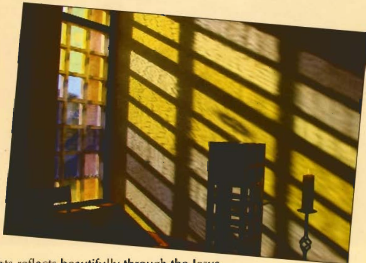
Lights reflects beautifully through the Jesus window at the Jesuit School of Theology at Berkeley.