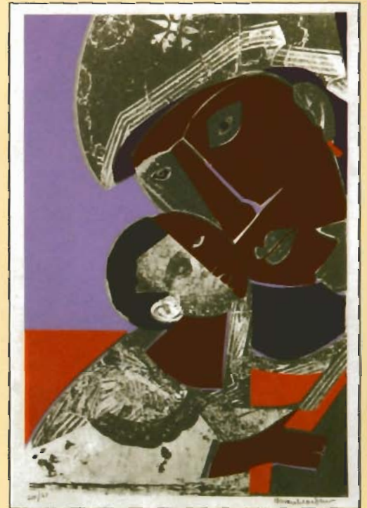
Title and Date: "Mother and Child," 1974 Artist: Romare Bearden (1911-1988) Medium: screenprint Dimensions: 24" x 16" Collection: Museum of Contemporary Religious Art, Saint Louis University