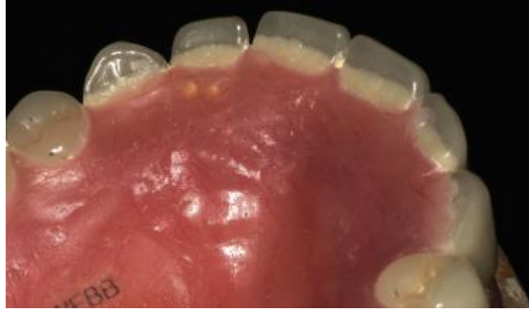
Figure 2. Rugae texture reproduced on palatal area of new complete removable dental prosthesis.