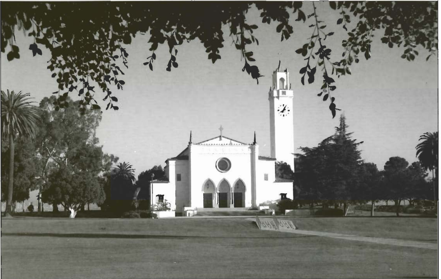
Loyola Marymount University.

has been established between number of theology credits and future salary range. Thus, there is frequent resistance to universal requirements in theology among both students and some colleagues in other disciplines. All too familiar is the question, “But what can I do with theology?”