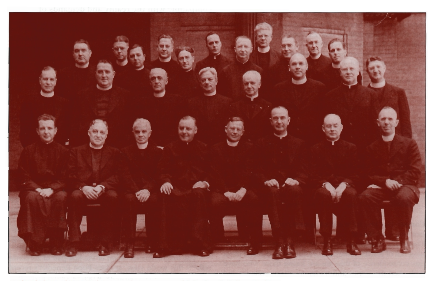
Undated photo of New York Jesuits.

To those critics who reject our vision for their own different vision, we can insist that we welcome dialogue and conversation. We can both learn from one another. Better still, we might work together in a venture that can help transform not only our colleges and universities, but through them our Church, nation and world.