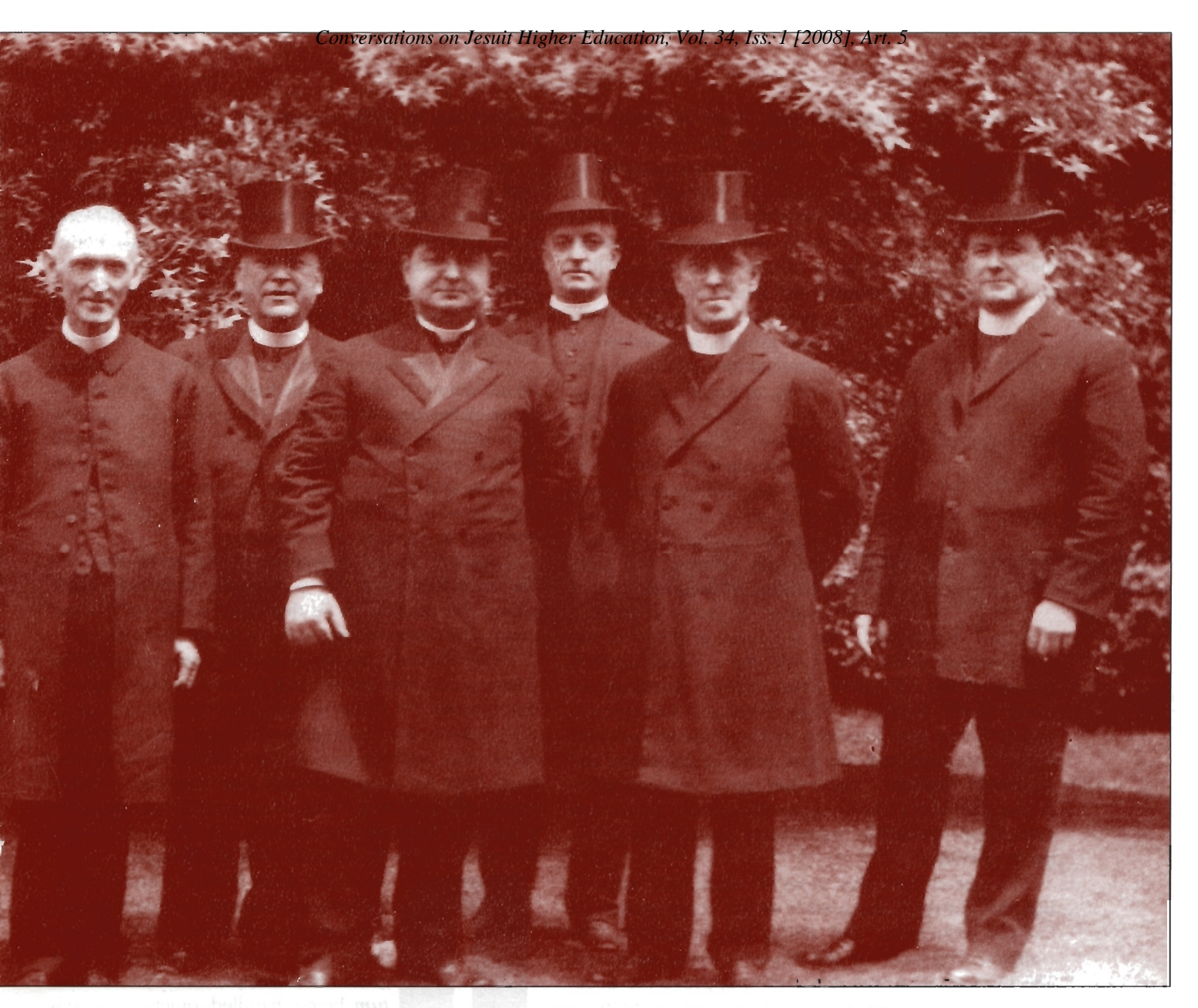
Early Saint Peter's College Jesuits circa 1880.