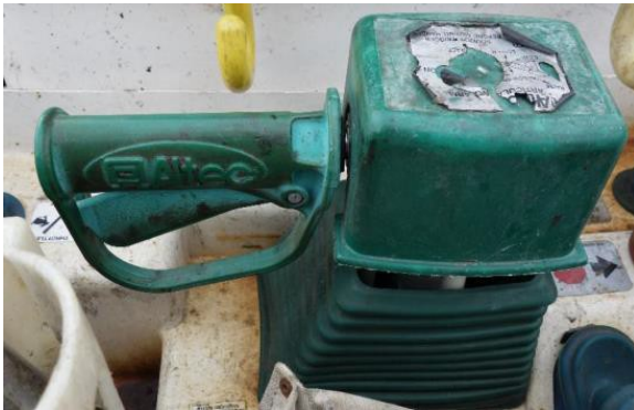
Figure 2. Pistol grip control in aerial bucket that moves in six directions to maneuver the aerial bucket.