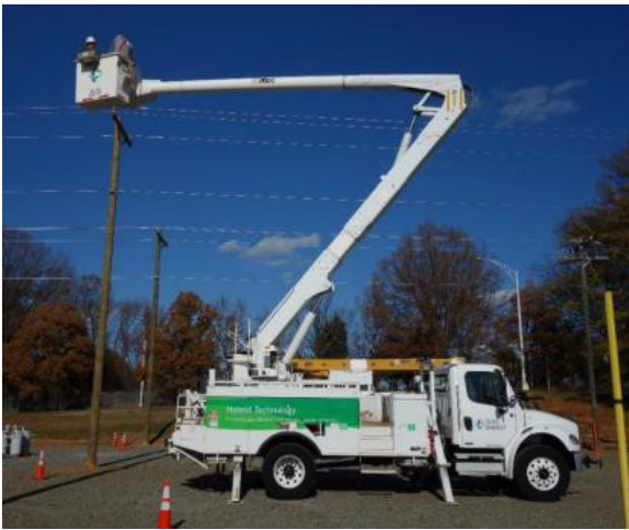
Figure 1. Typical electric utility aerial bucket truck with a 2-segmented boom.