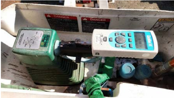
Figure 3. Chatillon™ force gage attached to the pistol grip control to measure forward/rearward force. A 3D printed clamshell (black) was secured to the pistol grip to provide a secure mount for the Chatillon™ gage.

Applied force data from this study represent a baseline of forces from current pistol grip designs from four major manufacturers (Altec, Terex, Telect, and Lift All).