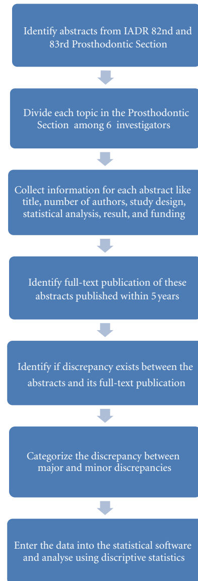
FIGURE 1: Flow chart of materials and methods.

Abstracts from poster and oral presentation for Prosthodontic Research Section of IADR 82nd and 83rd General Sessions (March 2004 and 2005) were obtained and divided among the six investigators (Figure 1). The investigators extracted data independently. For each abstract, the following basic information was collected: abstract topic, type of abstract,