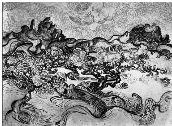
Vincent Van Gogh, Olive Trees in Landscape with Mount Gaussier and the Rock with Two Holes , 1889 Pencil, pen, reed pen and ink, 147 x 62.5 cm (18 1/2 x 24 1/2 in.) Nationalgalerie, Berlin.

Although Gao's pictures are rooted in the aesthetic tradition of Chinese brush painting, they display a modern edge by incorporating a spirit of endless innovation gleaned from Western painting. The modern edge in Gao's paintings is achieved in part by enriching the ink surfaces with subtle variations of light, texture, and ink saturation and by applying the techniques of modern photography (angle, depth of field, and focus) to achieve greater pictorial depth. Gao's perspective is called “diffuse point perspective,” or “false perspective” and is based on Chinese practices, rather than the linear geometric perspective of Brunelleschi and Alberti in the paintings of the Italian Renaissance. 2 Pictorial space in Gao's paintings, which contain both abstract and representational elements, is based