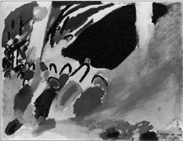
Wassily Kandinsky, Impression III (Concert) , 1911 Oil on canvas, 76.8 x 100 cm (30 1/4 x 39 3/8 in.) Städtische Galerie im Lenbachhaus, München.

on inner feelings rather than observations of the external world. According to Gao, “Inner visions have no depth of field; they cannot be taken apart by geometry or arranged according to topology...” 3 He likens the experience of space in his pictures to a dream-like journey into the interior of the picture “which shapes an inner vision and evokes emotion, energy and vitality.” 4 A single lost figure wanders through the sparsely marked foreground space in Gao’s Towards the Unknown (1993) into threatening dark patches of the picture, suggesting what a corresponding inner journey might be like. The experience demands attention and imagination from the painter as well as from the viewer.