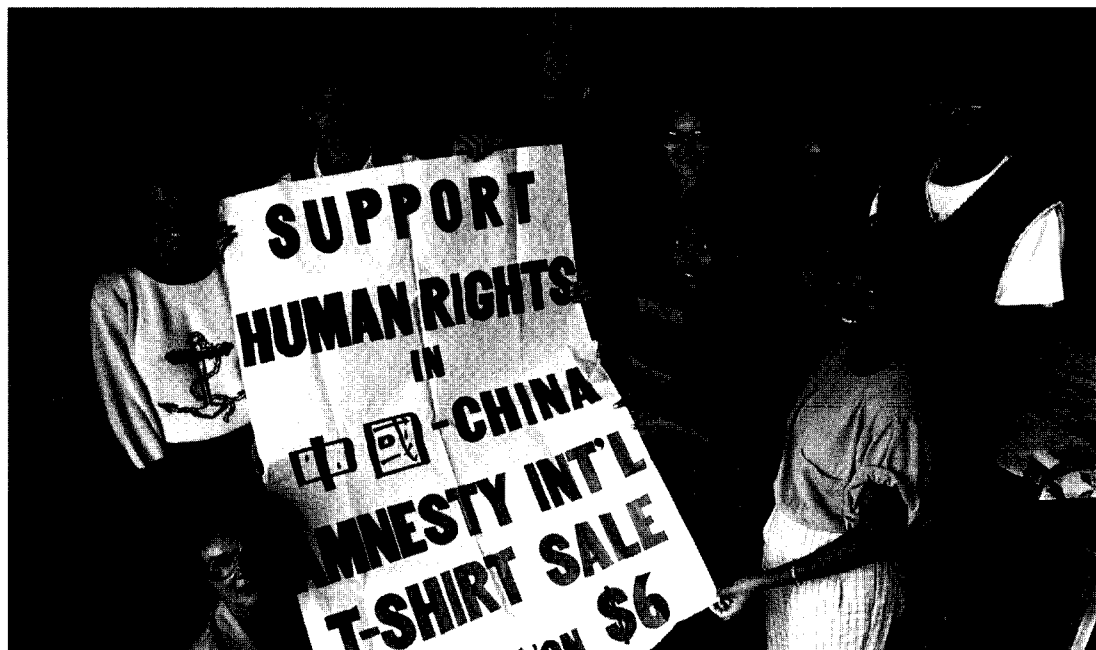
Members of the Canisius College chapter of Amnesty International.

For fourteen years, faculty, staff, and the occasional student have gathered to read about and reflect upon Ignatius's vision for the Christian life. The Ignatian Seminar was initially founded to explore the history and philosophy of the Society of Jesus. Topics have ranged from the nature of spirituality to specific concerns