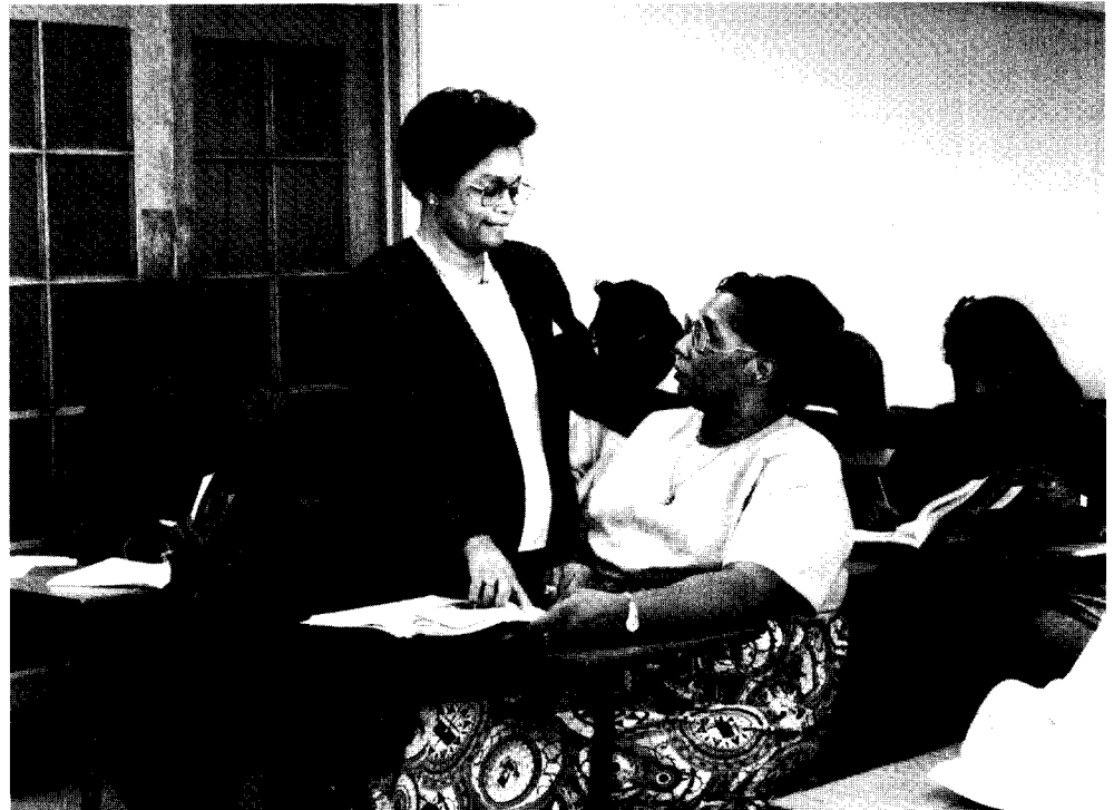
McAuley School of Nursing's Passages Program provides academic support for pre-nursing students.

■ The University's professional schools and programs provide clinical services to community members at little or no cost. At the Urban Law Clinic, law students offer free legal counsel for people with