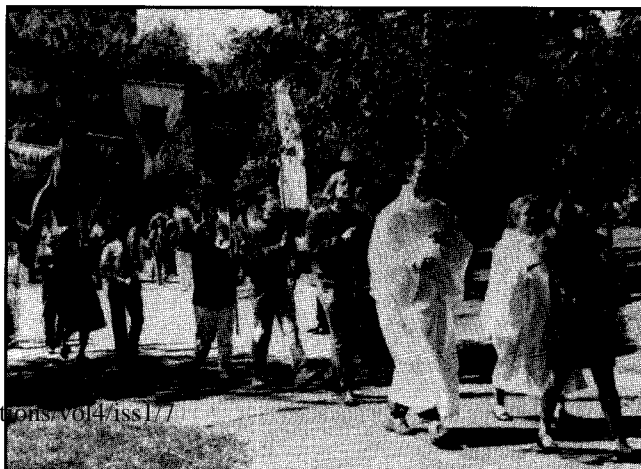
Liturgy on campus at Saint Louis University.

Four new ventures of the last two years strengthen the university in its mission. First, the Centre for Com-