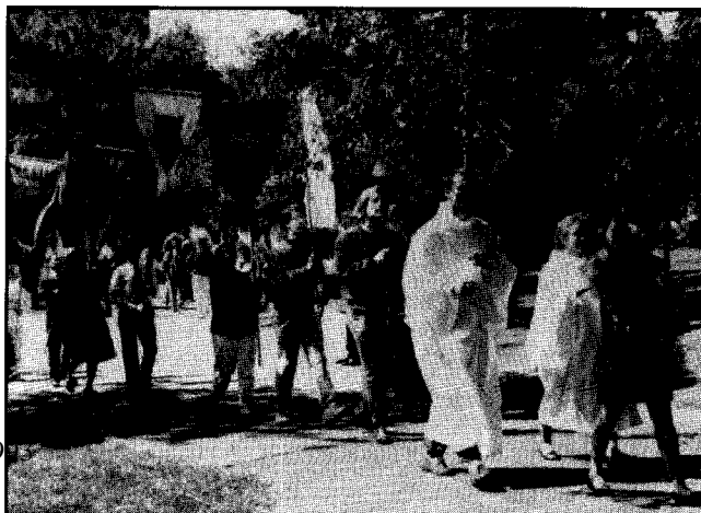
Liturgy on campus at Saint Louis University.

Four new ventures of the last two years strengthen the university in its mission. First, the Centre for Com-