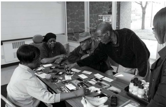
Figure 1. Participants discussing photographs and grouping similar images together.

For the final group meeting, all photographs that were taken were printed as 4x6-inch photographs. Printed photographs were spread out on a table. Participants were asked to group similar images together. They were then asked to give a name, topic, or theme to the group of images. Discussion among participants occurred until consensus on a topic or theme was reached. Several themes were assigned to a group of photographs if there was not a consensus among participants. A detailed description of data analysis procedures and results from the exemplar study can be found in previously published articles (Woda, Belknap, et al., 2015; Woda, Haglund, et al., 2015).