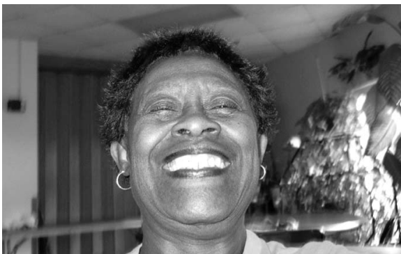
Figure 2. Participant's photograph of herself.

Using photovoice encouraged participants to present their lived experience through images, language, and context. Ultimately, group discussions provided participants an opportunity to reflect on the personal and community facilitators of and barriers to engaging in HF self-care behaviors. Participants made statements such as "I am glad you're letting me tell my story," "I am happy someone asked me this stuff," and "This is important information to share." One participant took a photograph of herself, stating that she was "happy to help others".