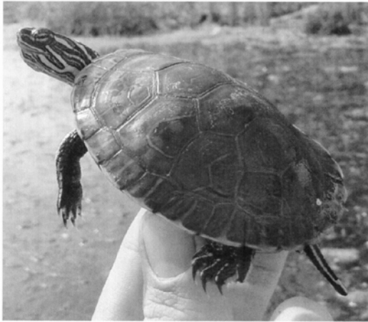
Juvenile painted turtle captured in central Minnesota in 2002. Small size and attractive coloration make painted turtles desirable pets.