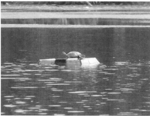
Basking adult painted turtle about to be captured in one of our basking traps on Stump Lake, Stearns County, Minnesota.

While the total number of harvested turtles reported each year to the Minnesota DNR varied substantially, the mean number of turtles captured per harvester did not. The reasons for this apparent discrepancy were yearly fluctuations in number of harvesters filing permit returns and dramatic catch increases in 1994 and 1998. Catch increases in these 2 years primarily were due to the activities of 2 harvesters catching 17,883 and 28,000 turtles, respectively, in 1998 and 1 harvester who captured 35,000 turtles in 1994. Seventy-five percent of all harvesters reported catching <1,200 turtles per year, indicating that most of the harvest was done at a relatively small scale. Any inferences taken from these numbers should be viewed cautiously; there was evidence that some harvesters underreported their catch and not all harvesters filed yearly returns (J. Moriarty, Ramsey County Parks, personal communication).