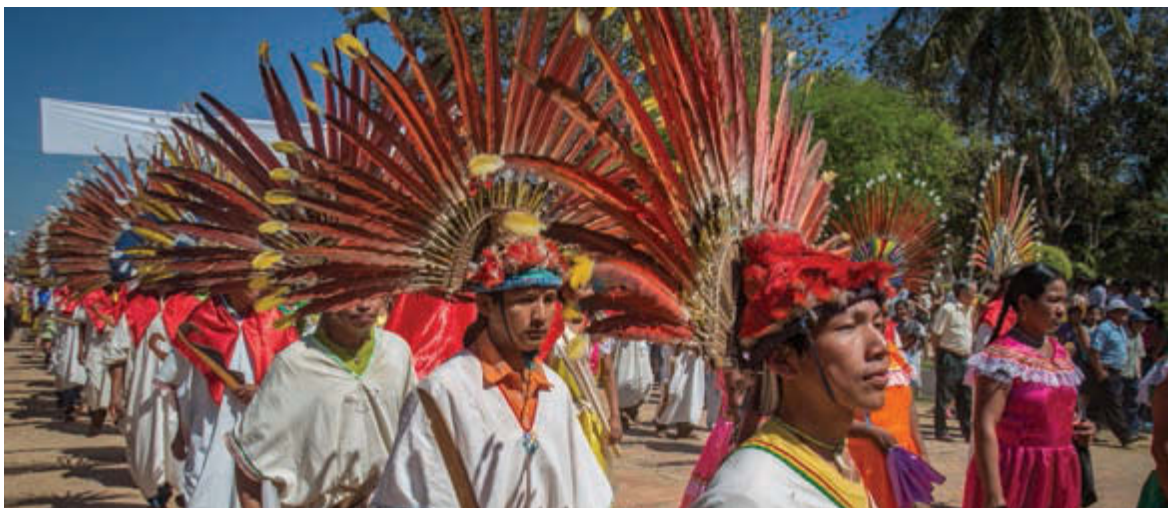
Below: The various tribal bands of Macheteros lead an afternoon procession around the town to celebrate the feast of St. Ignatius.