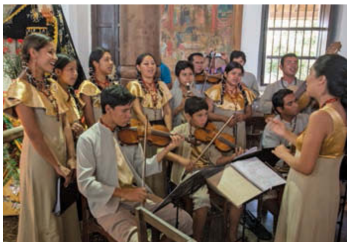
During the mass of St. Ignatius, the Ensemble Moxos, the choir from the local conservatory of music, sang the traditional 17th-century "Ignaciano" compositions they learned from the Jesuits.