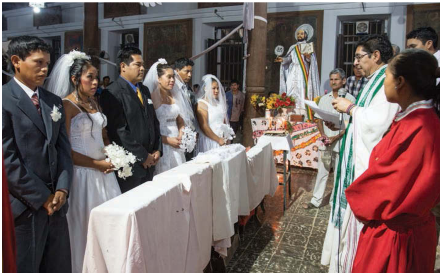
Often couples choose to celebrate their wedding during the octave of the feast of St. Ignatius.

a large area of what had previously been a fiercely hostile grouping of tribes. The Moxos reductions flourished and quickly became the envy of neighboring Spanish and Portuguese settlements. The Moxos people quickly learned how to harvest crops through cooperative farming. They raised a breed of cattle that flourished and was so plentiful they sold the surplus in Spanish and Portuguese towns. They also were known for their beautiful tapestries and wool work. In addition, they formed one of the largest orchestras in that part of the world and played music by the Jesuit composer Domenico Zipoli, fusing baroque instruments with their indigenous music. Many of these compositions survive today and warrant further musicological study.