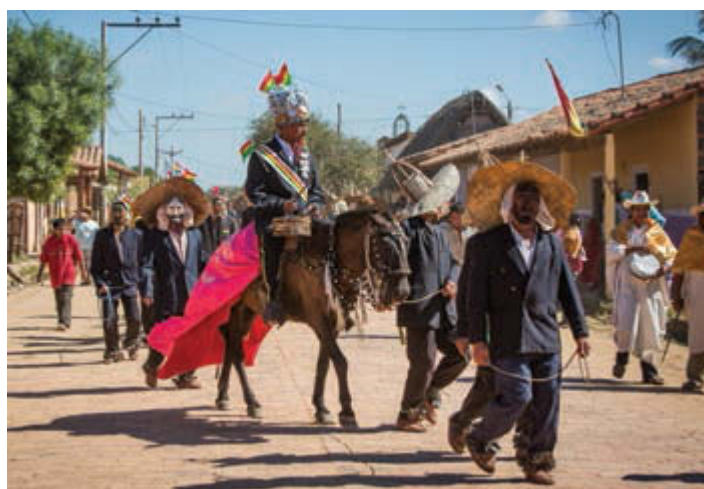
The Tintiririnti, the "herald of the feast," is a young man chosen for his virtue, who leads the procession around the village toward the church.