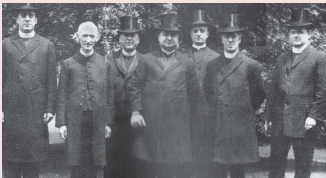
The Jesuits of Saint Peter’s College.