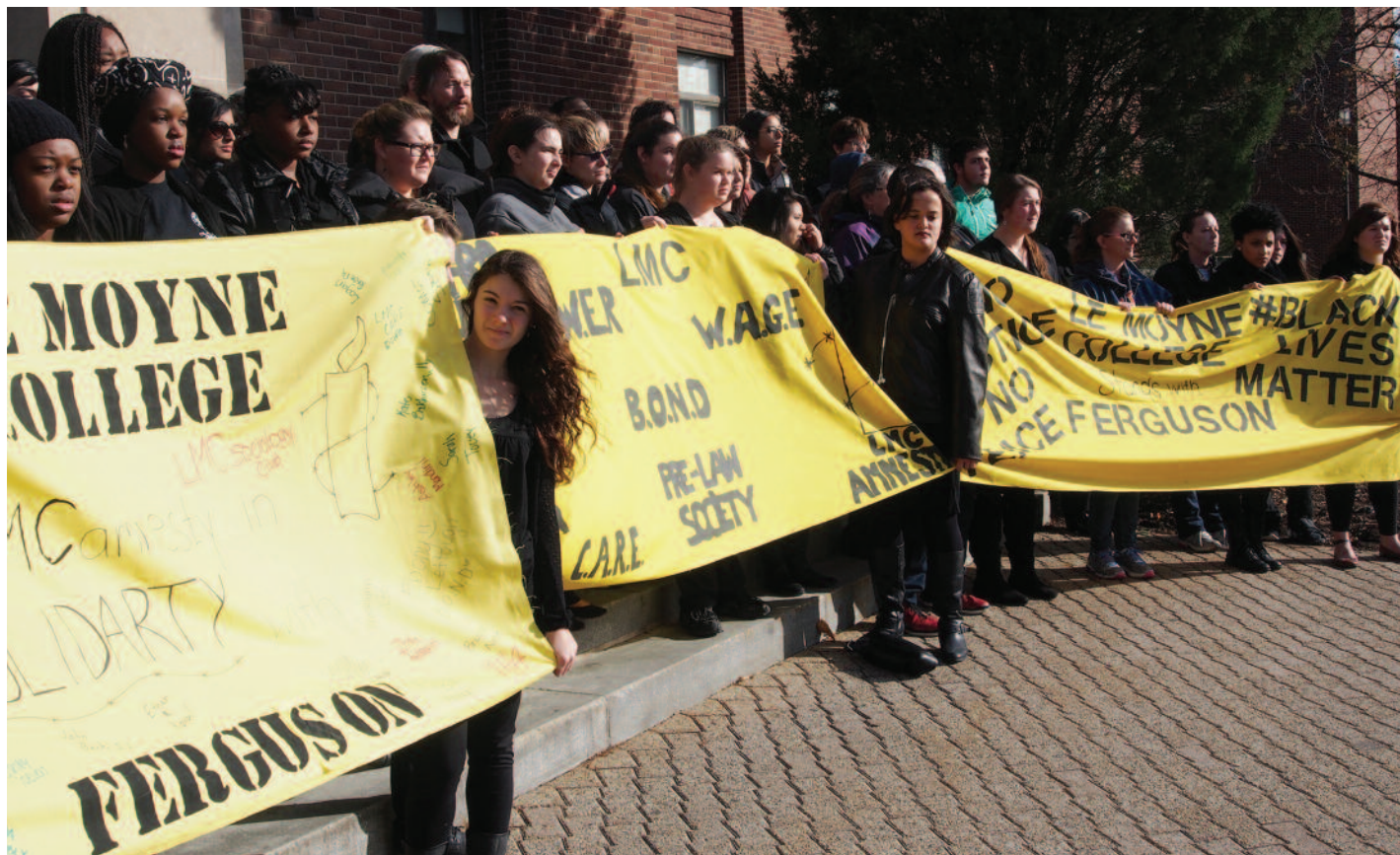
In May 2015, approximately 50 students, faculty, and administrators gathered outside of Grewen Hall, Le Moyne College, to express their solidarity in support of the people of Ferguson. Following a moment of silence, the group walked throughout the main academic complex before reconvening outside for prayer and reflection.

Such thinking explains in great measure the apathy or indifference of white Christians toward police violence and misconduct in our society, especially as these are experienced by communities of color and protested by the Movements for Black Lives. A recent Public Religion Research Institute report related how over 80 percent of black Christians believe that police-involved killings of black people are part of a much larger picture of racial injustice. However, an almost equal number of white Christians believe the opposite, holding that such deaths are mainly isolated incidents with no connection to one another. (Seventy-one percent of Catholics hold this view.) Indeed, white non-Christians are more likely to see a systemic problem than white Christians.