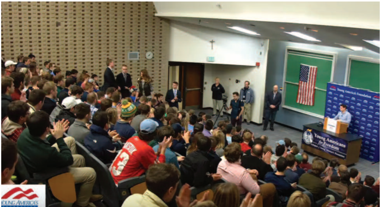
Ben Shapiro speaks to students in a packed lecture hall at Marquette University.

Let us consider a concrete example of how this insistence upon the demise of systemic racism and assumption of personal responsibility plays out.