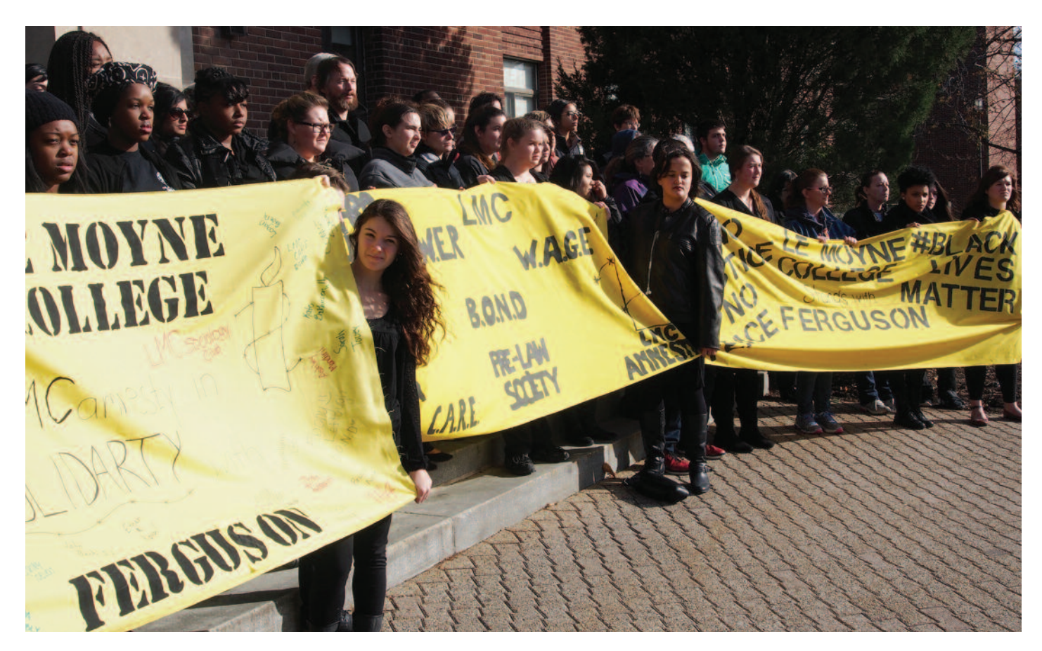
In May 2015, approximately 50 students, faculty, and administrators gathered outside of Grewen Hall, Le Moyne College, to express their solidarity in support of the people of Ferguson. Following a moment of silence, the group walked throughout the main academic complex before reconvening outside for prayer and reflection.

Such thinking explains in great measure the apathy or indifference of white Christians toward police violence and misconduct in our society, especially as these are experienced by communities of color and protested by the Movements for Black Lives. A recent Public Religion Research Institute report related how over 80 percent of black Christians believe that police-involved killings of black people are part of a much larger picture of racial injustice. However, an almost equal number of white Christians believe the opposite, holding that such deaths are mainly isolated incidents with no connection to one another. (Seventy-one percent of Catholics hold this view.) Indeed, white non-Christians are more likely to see a systemic problem than white Christians.