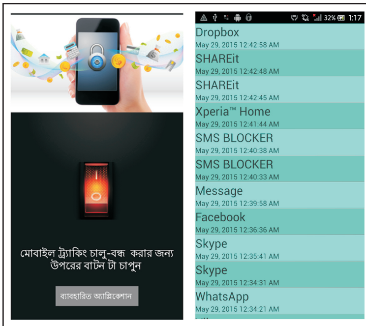
Figure 2. Screenshots of the Protiraksha application. Left: The application prompts the user to turn on tracking. Right: The application shows the log of timestamps of when different applications were accessed.

addition, it would be possible for the repairer to turn off the app or find other ways to access private data that bypassed this kind of surveillance. However, we designed the app to understand, if such monitoring software existed, how users and repairers would react to such a tool and if technical interventions like this might aid privacy during repair. After deploying the app, we conducted several interviews, described in the following section.