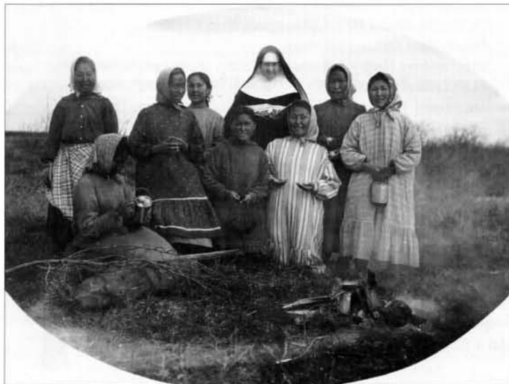
Eskimo girls and a nun with recently collected wild gull eggs, Akulurak, Alaska, undated (ca. 1900-1920).

published in The Indian Sentinel, 2:7 (July, 1921).