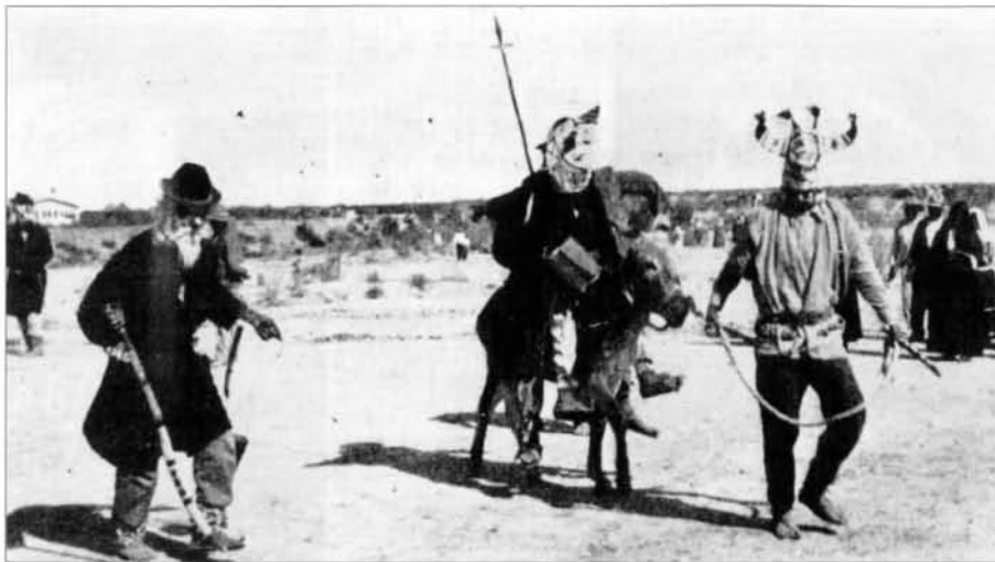
Yaqui ceremonies on Palm Sunday, 1921, featuring the enemies of Jesus—a “Fariseo” [Pharisee] (left) and two “Chapayekas”, the solders of the Fariseos. Faithful Christians defeat them on Holy Saturday by throwing a barrage of confetti flowers and confetti eggs.

Courtesy Marquette University, Bureau of Catholic Indian Missions Records; published in The Indian Sentinel , 2:7 (July, 1921).