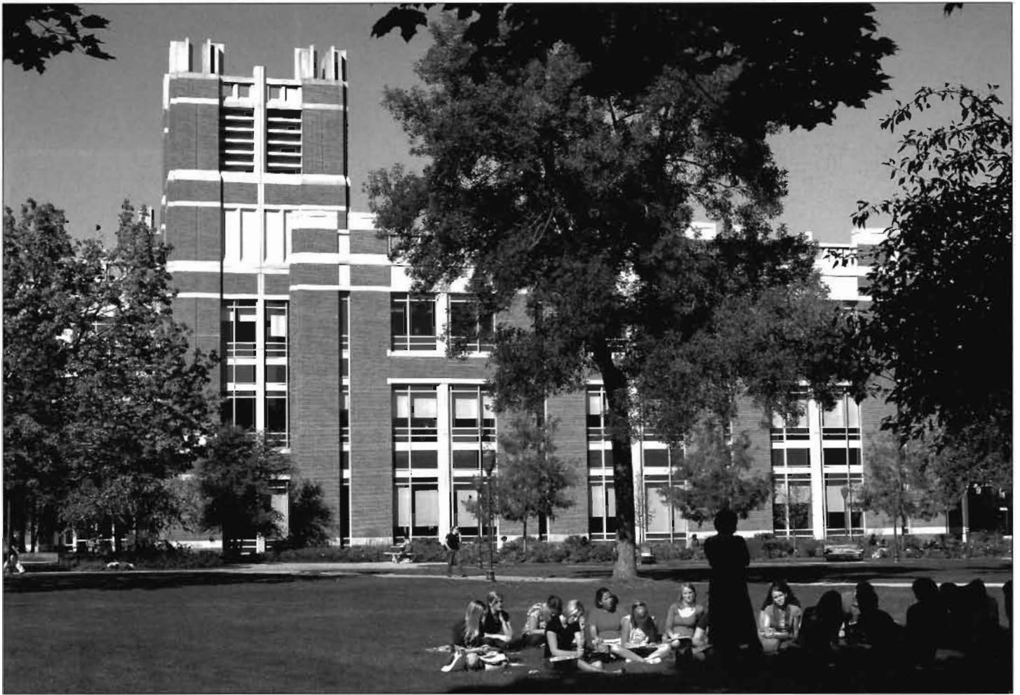
A class being conducted on the lawn at Marquette University.

competent, conscientious person, capable of compassion and ‘well-educated in solidarity.’” In a further remark, connected with global solidarity, Kolvenbach insists that: “By definition, universality and the possibility of exchanges at all levels belong to the very nature of the university.”