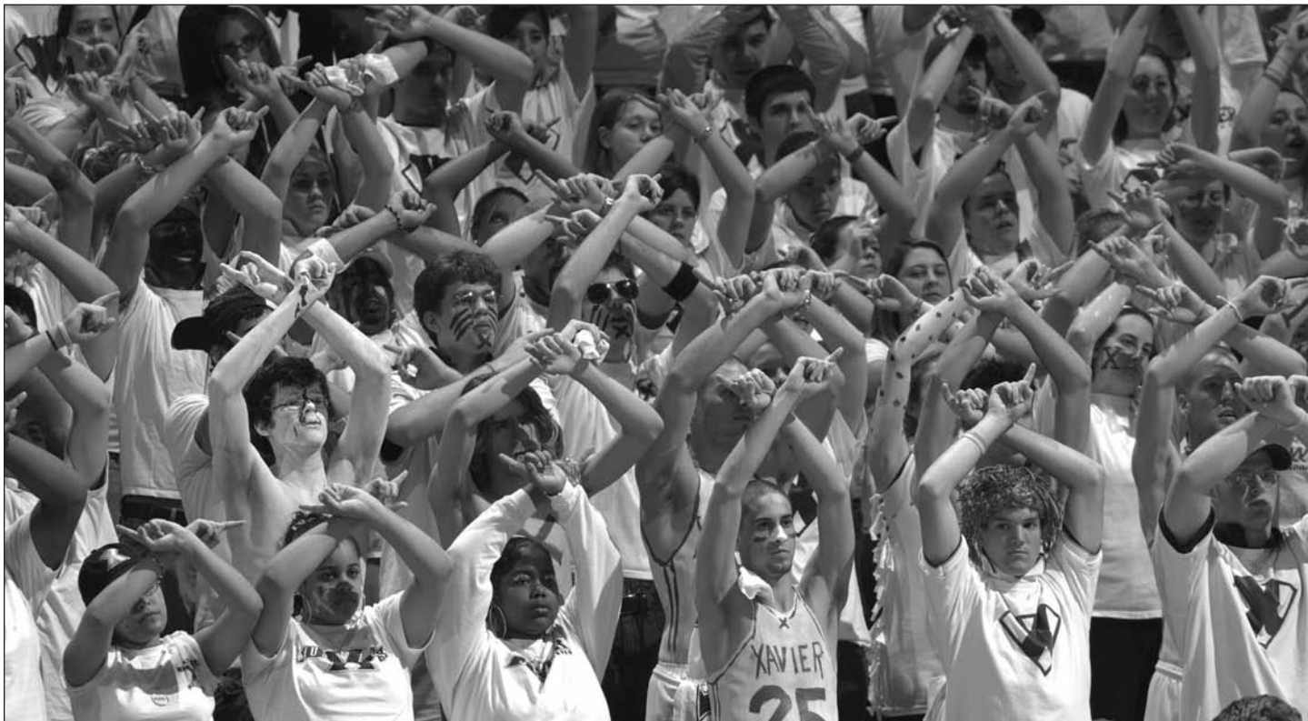
Fans cheer on their team at Xavier University.

by young adults who know well adjusted and loving homosexual persons, some of whom are family and friends. We all must live up to the teachings of the church that homosexual persons are to be accepted and no discrimination is to be shown towards them.